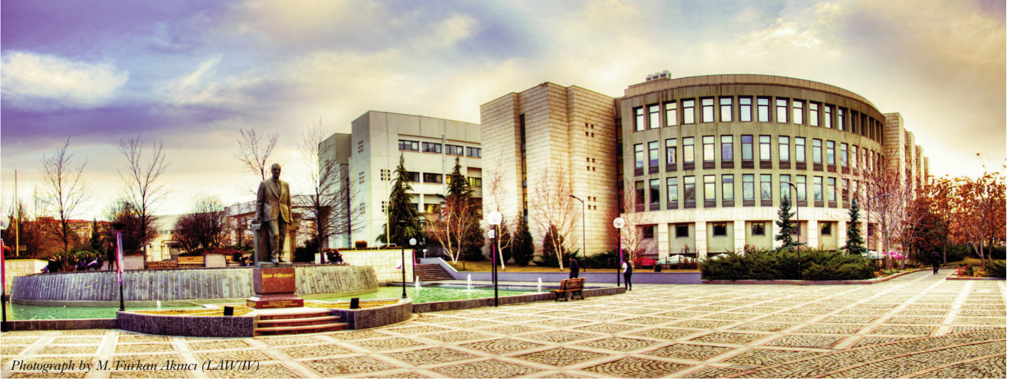
Photograph by M. Furkan Akıncı (LAW/IV)